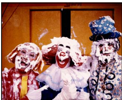
Pie fight aftermath picturing L-R Cooky the Clown, Bozo and Wizzo